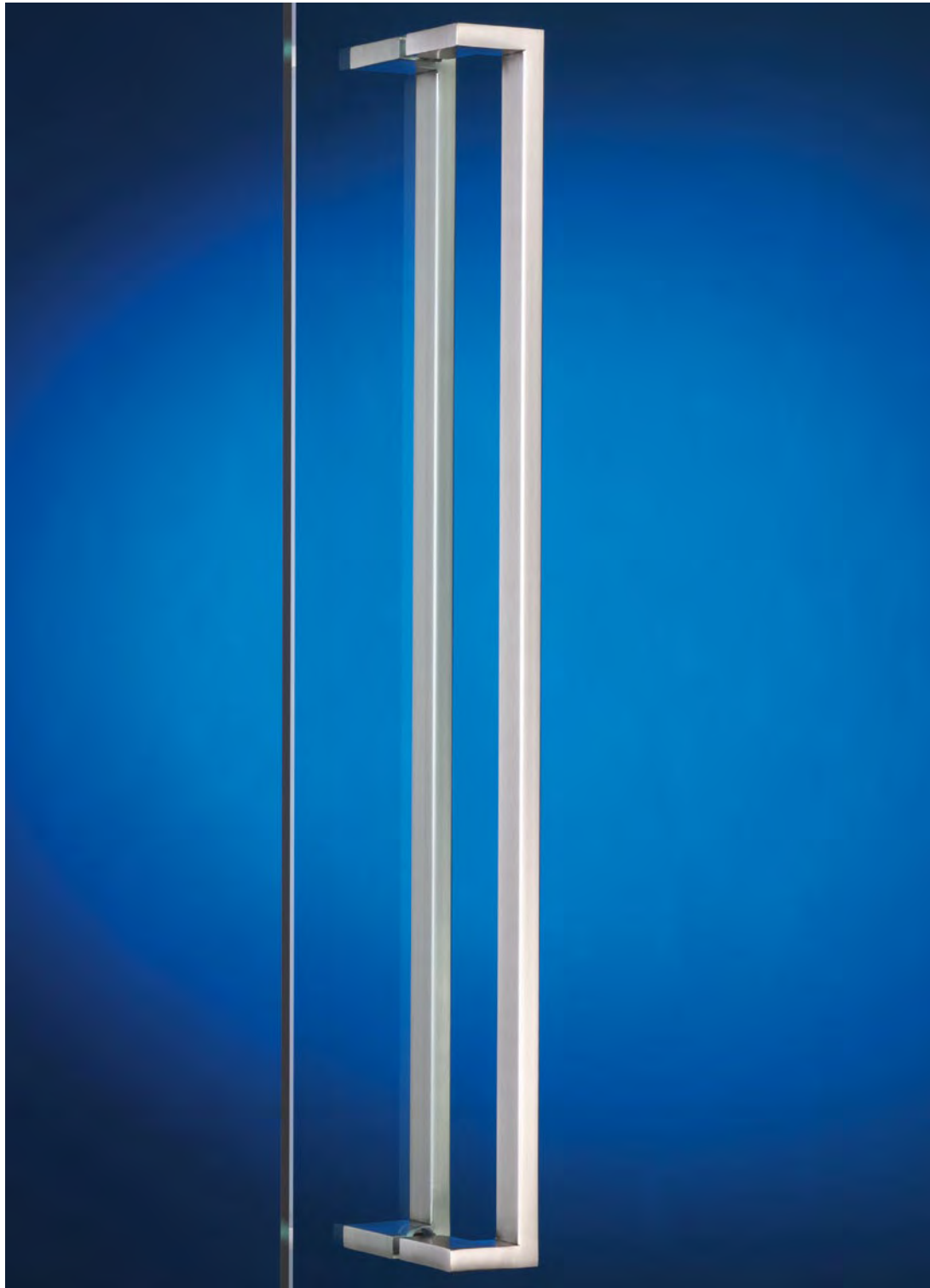
madinoz MDZ 25120F

NOTE: Special sizes available on request